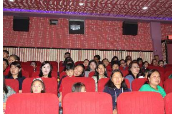
Day 2; inside the movie hall