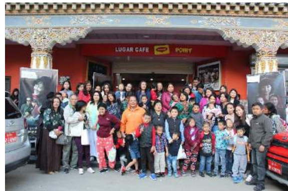
Day 2; Group photo