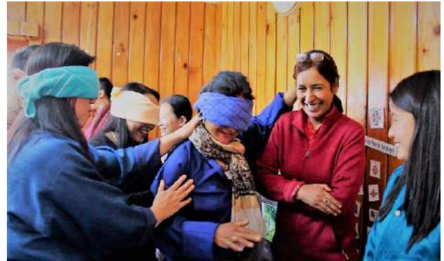
Blind fold activity