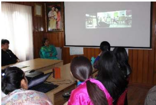
Day 1; presenting short video clip