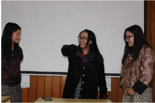
Day 1; buttoning coat activity