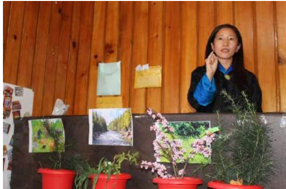
Story telling (Rabbit & the tortoise)

initiated to include parent in Board Member to encourage in decision making and promote participation.